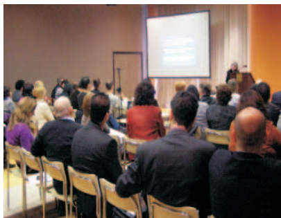
2nd International Workshop Multi-type Content Repurposing and Sharing in Medical Education Plovdiv, Bulgaria, 21 January 2010

The aim of mEducator is to implement and evaluate standards and models in the field of e-learning in order to enable specialized state-of-the-art medical educational content to be discovered, retrieved, shared and re-used across European higher academic institutions. European-wide collaboration is required for two reasons. First, to achieve sharing of a critical mass of multi-type medical educational content; second, to address and extend best practice and recommendations to as many EU countries as possible. To do so, mEducator builds up pan-European synergies in order to go beyond what has already been achieved by existing or past related projects